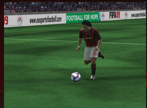
FIFA 09 promises a lot with its dynamic new graphics interface

Every year EA Sports comes out with a new FIFA game promising for better graphics but they haven't lived up to their expectation. It has all been an OK performance since FIFA 07 where new graphics were introduced latest. The