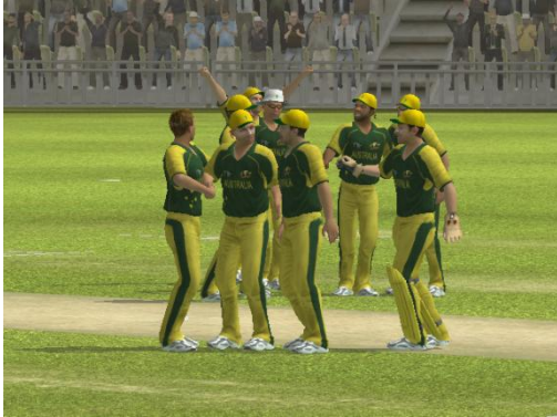
We review the Ricky Ponting International Cricket 07