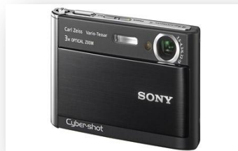
A good digital camera is sometimes what you need and the T2 is just perfect.