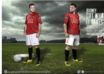
A review on the FIFA 08